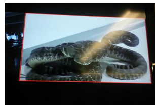
A Western Diamond Back Rattlesnake

reasons. The skin is used for purses, belts, and hats. Many Texans enjoy the meat as well. The students said "It tastes like chicken"! They gave a warning of "grossness" for those with a queasy stomach as they showed video of the internal organs in-