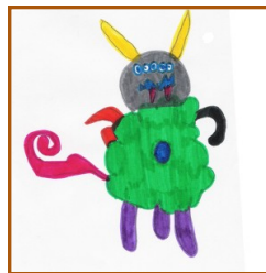
El Dorado K-1

During the last two weeks in October, twelve classes from grades K-6 participated in the annual Monster Exchange Project. This project focuses on descriptive writing, following directions, and teamwork. Each class created a unique monster, wrote instruc-