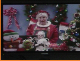
Mrs. Claus with CESA 7

Looking for an IDL program for the Holidays? There are many to choose from!