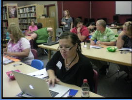
SCK teachers and facilitators

August 10, 2010 IDL teachers and facilitators from South Central KS Distance Learning Network and the TEEN Network joined together by videoconference for a one day workshop to learn about videoconferencing in the classroom. Teachers and facilitators were able to network and discuss many hot topics in the IDL classroom.